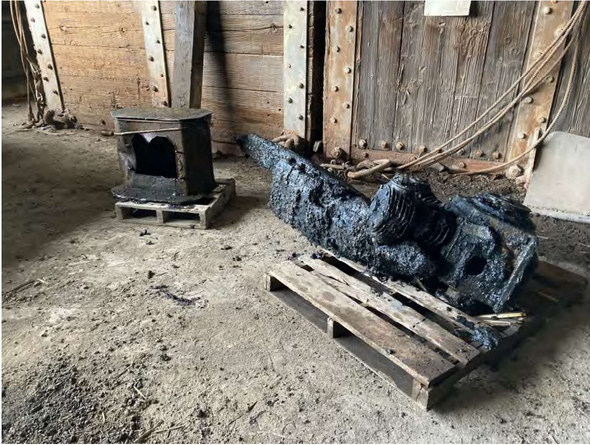
Photograph 14 – Items of interest: stove, machine and wood in storage area, front view.