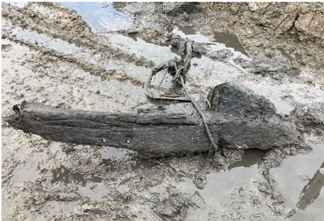
Photograph 13 – Unidentified piece of curved wood, front view.