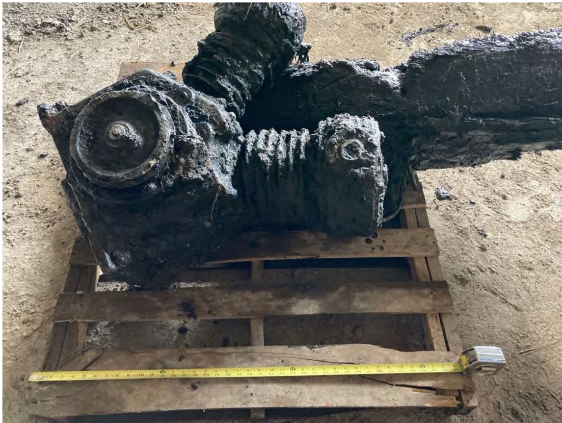
Photograph 12 – Unidentified machine or motor, front view.